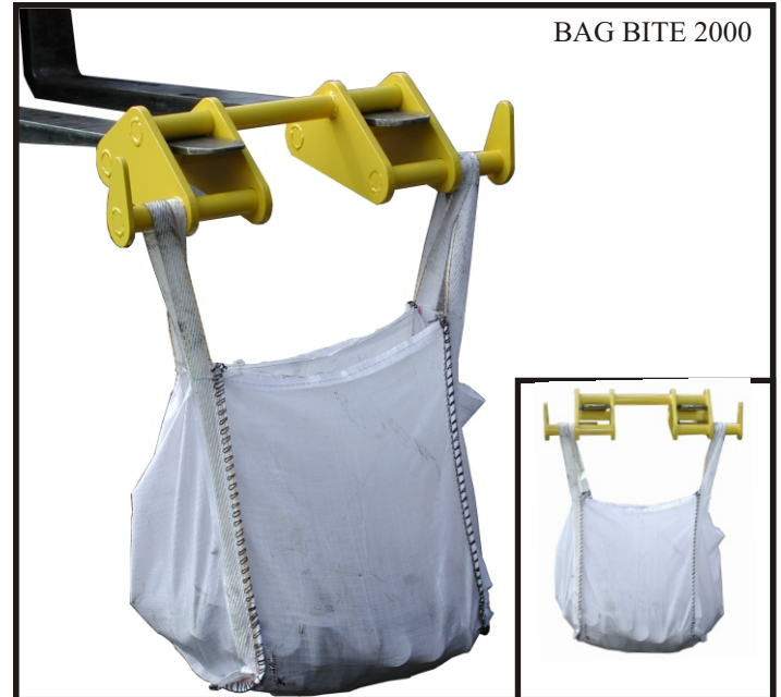
BAG BITE 2000

The Bag Bite comes complete with Test Certificate / Letter Of Conformity and is CE Marked.