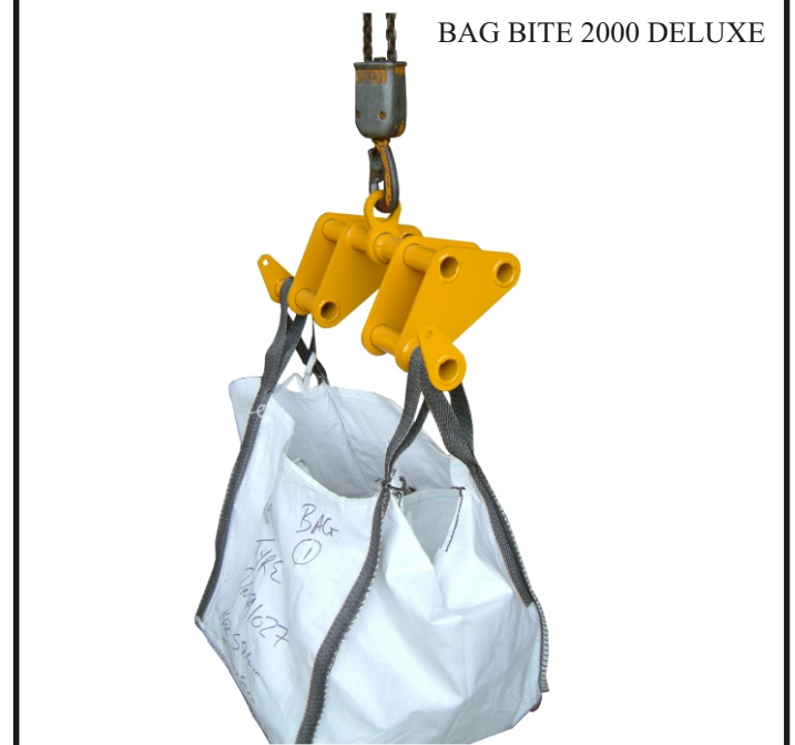
BAG BITE 2000 DELUXE

Maximum Safe Working Load:- 2000 Kg Fork Pockets Size:- 120 x 50mm (Other Sizes On Request) Fork Centres:- 365mm (Other Sizes On Request) Weight:- 20 Kgs Overall Dimensions:- 740 x 340 x 170 mm (WxLxH) Finish:- Enamel Paint