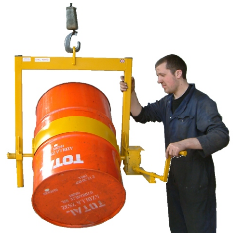
Cranked handle control