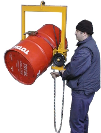
Chain loop control