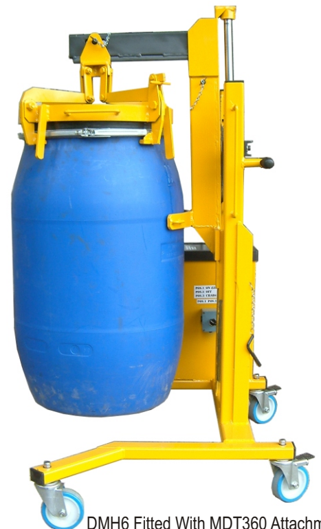
DMH6 Fitted With MDT360 Attachment

The appearance or specification of equipment described or illustrated in this leaflet may differ as improvements or amendments are incorporated in line with our policy of continuous improvement.