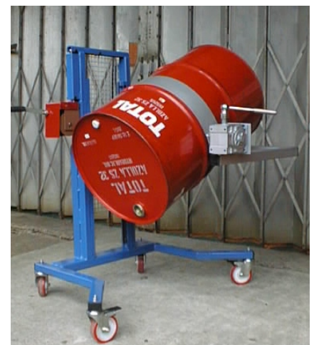
DMW 300-4 DRUM TILT ATTACHMENT OPTIONAL EXTRA