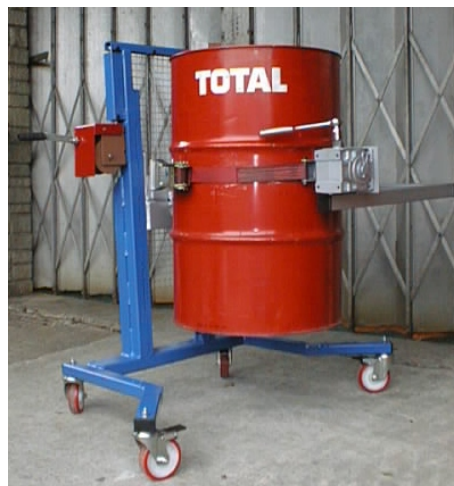
DMW 300-4 DRUM TILT ATTACHMENT OPTIONAL EXTRA