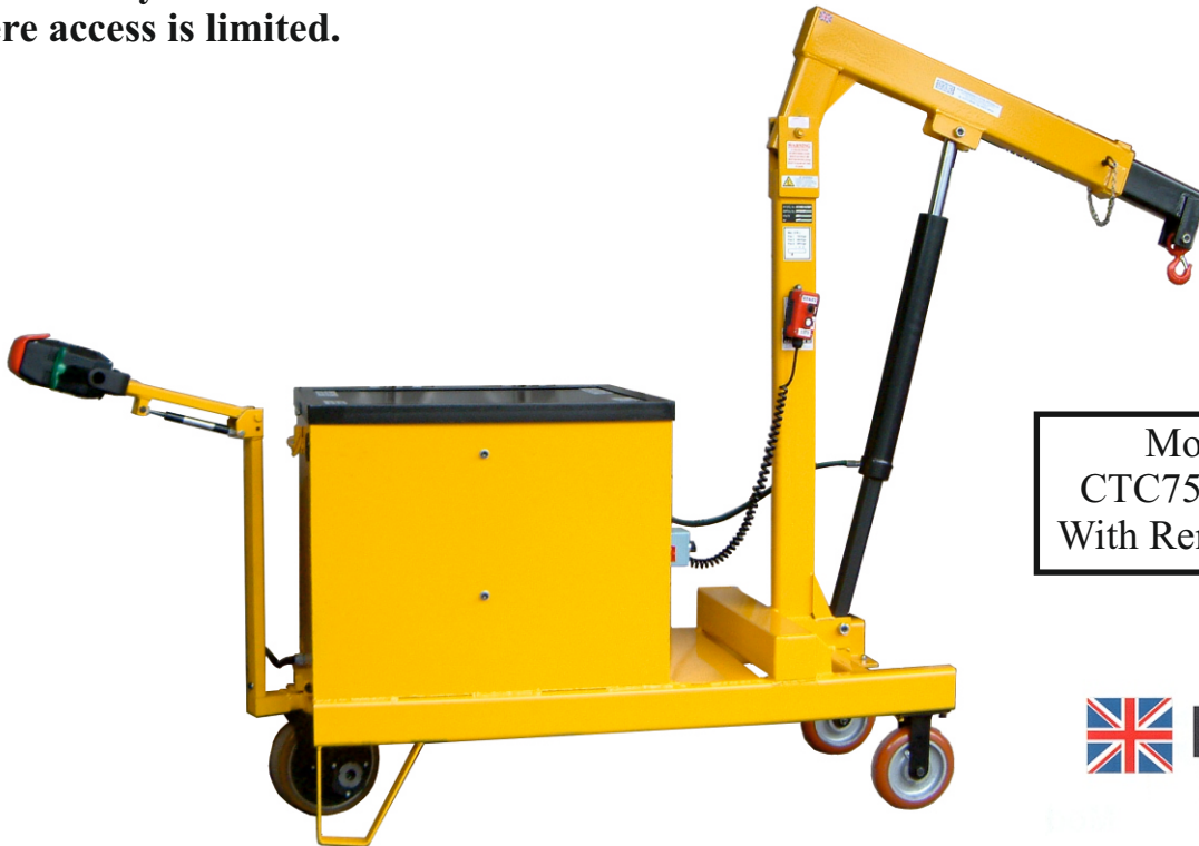
Model Shown CTC750 Power Drive With Remote Power Lift

These trolley cranes offer clear access and freedom of movement at the lifting area where access is limited.